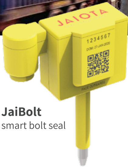
JaiBolt smart bolt seal