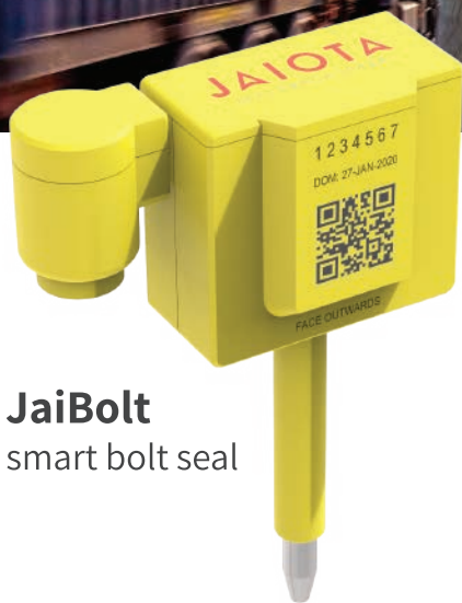
JaiBolt smart bolt seal

Seamless real-time control over all shipments and freight transportation